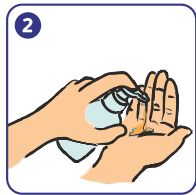
Take sufficient amount of Soft Care® Sandalwood handwash on your hands.