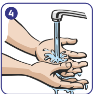
Rinse hands thoroughly. Remove all traces of lather.