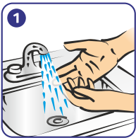
Wet your hands.

Soft Care® Sandalwood perfumed gentle hand cleanser is ready-to-use. It can be easily dispensed through any refill / top-fill dispensers.