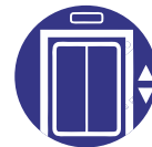
Stainless steel lift doors