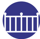
Stainless steel railings