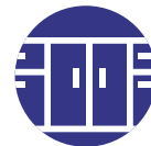
Stainless steel doors