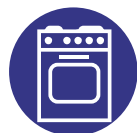
Stainless steel equipments